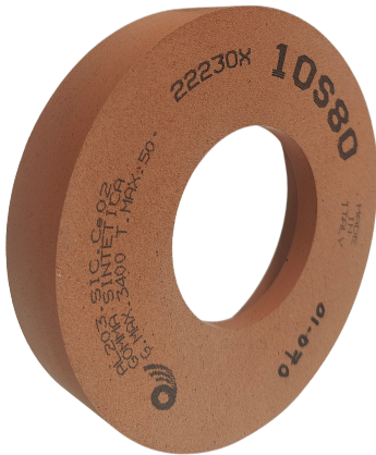
01-068, 01-069, 01-070, 01-071