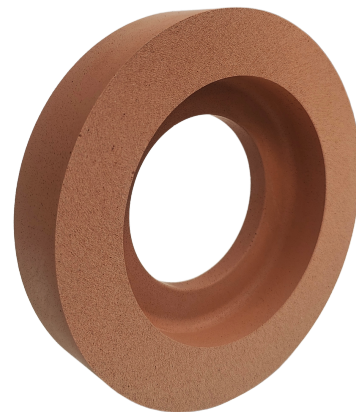
01-0587, 01-0597, 01-0607, 01-0637