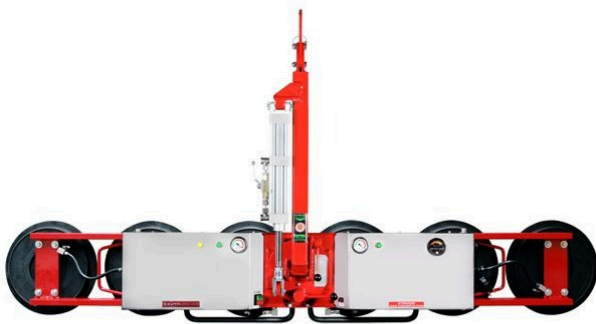
Onboard control Also available for hire

KAPPEL Vacuum Lifter DSKE2-12V (Vac Rig 450kg InLine) is a German-engineered glass vacuum lifter designed for safely handling long, narrow glass panels such as fins. Featuring a 6-cup in-line configuration with dual independent vacuum circuits for maximum safety, it can be expanded with load-bearing extensions to increase glass length and capacity. Supplied on a lightweight trolley.